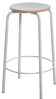
BarTabCollege ht80 ep01 HP00