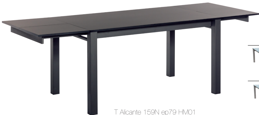
T Alicante 159N ep79 HM01